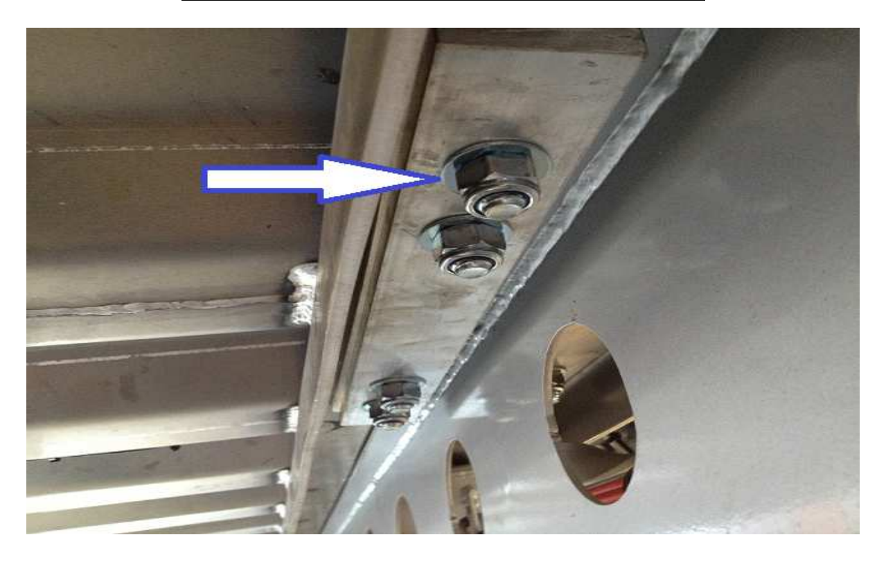
Torque all bolts as indicated by arrow above on clamp plates to 148nm periodically every 50,000 km